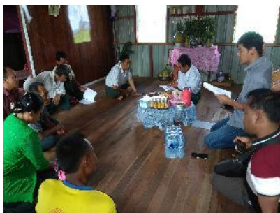
School staff and community members meet with Child's Dream representatives.