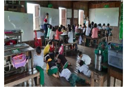
Students attending class in one of the classrooms.