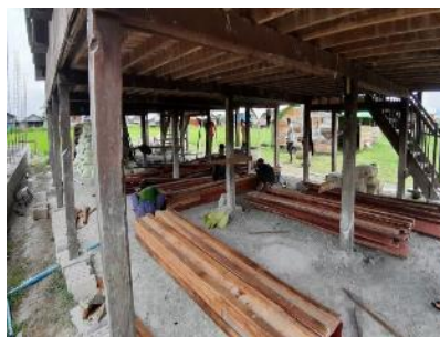
Construction materials have arrived.