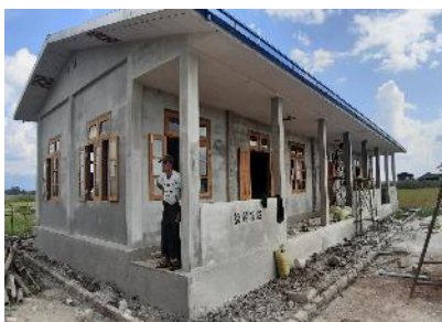
The walls are now finished with concrete stucco and the window frames are in place.