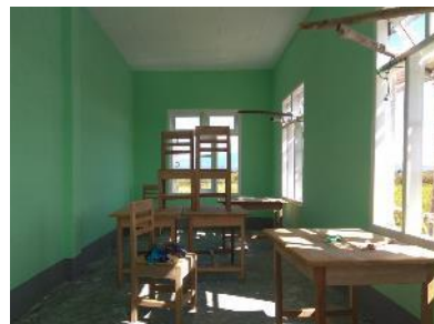
The interior of the building is progressing fast.