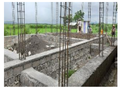
The construction started in July 2019.