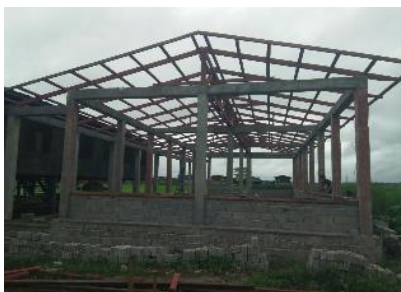
Construction ran smoothly despite the intermittent rain spells across Shan state.