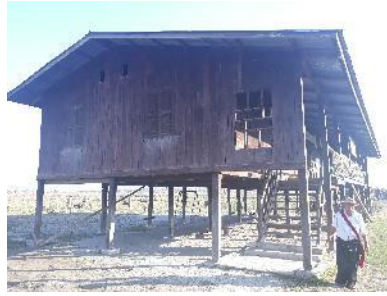
The temporary building was unsuitable and in dire need of replacement.