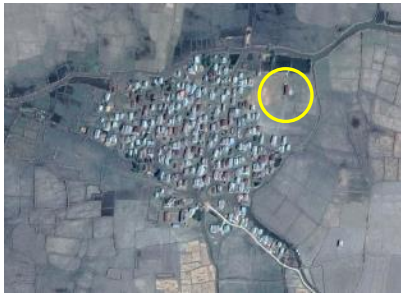
Aerial view of the Par Moon village. Encircled in yellow is the Par Moon primary school campus.