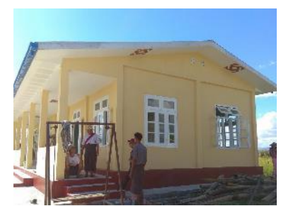
The almost completed building.